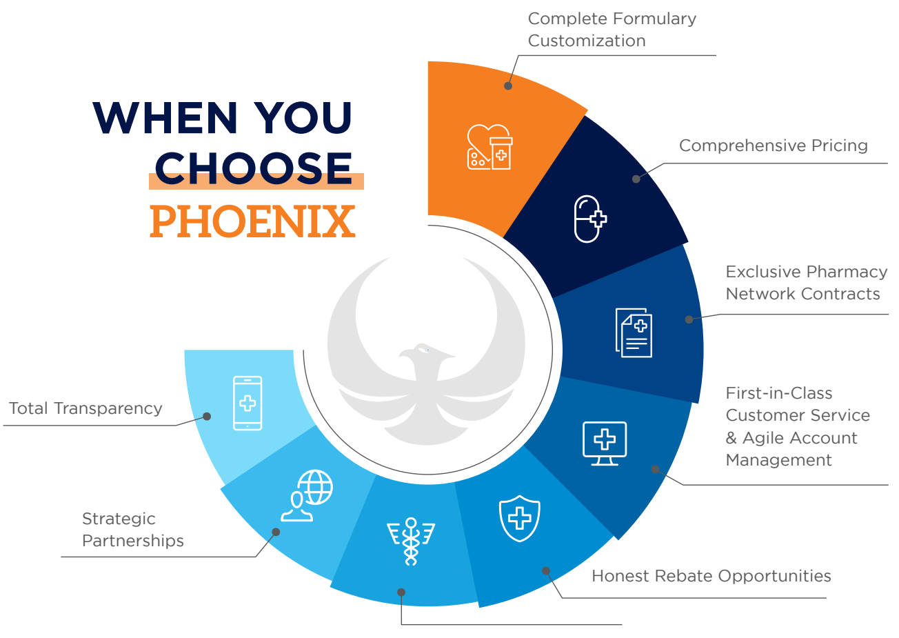
Specialty Savings Programs